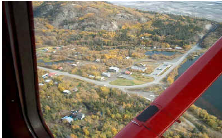
Photo 3: Aerial view of Chitina, No photo date available.