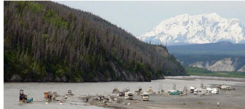
Photo 2: Fish wheels on the Copper River near Chitina. No photo date available.