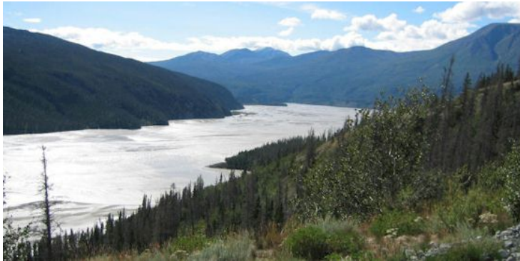
Photo 1: Fed by glaciers, the Chitina River is a classic example of a braided river; National Park Service photo, No photo date available.